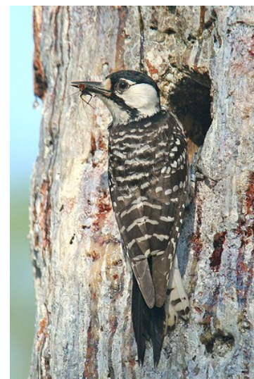
The Red-cockaded Woodpecker (Picoides borealis) received more funding than any other species: $161.5 million over the last 19 years.

Installations manage T&E species through consultation with the USFWS and implementation of their Integrated Natural Resources Management Plans (INRMPs). INRMPs are planning documents that allow DoD installations to implement landscape-level management of their natural resources, including T&E species. INRMPs identify specific actions required to minimize effects to listed species while ensuring military mission requirements are met. Specific management actions identified in installation INRMPs vary by species and landscape, but can include captive breeding programs, habitat enhancement, prescribed burning, invasive species management, noise effect studies, monitoring, and inventory.