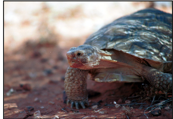
The Desert tortoise ( Gopherus agassizii ) is listed as threatened under the ESA, and was found on 11 DoD installations in FY08.

Each fiscal year (FY), the Military Services are required to report their T&E expenditures to the USFWS. These data summarize the costs for managing T&E species on DoD lands, and include actions such as species surveys and monitoring. The USFWS then reports these expenditures to Congress for all federal agencies.