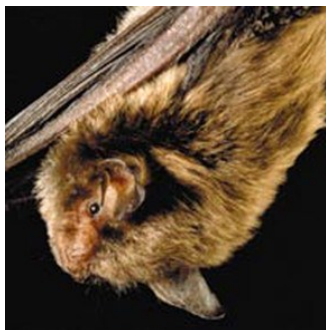
The endangered Indiana Bat (Myotis sodalis), found on several military installations, received more funding than any other mammal on DoD lands: $13.3 million over the last 18 years.